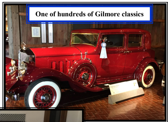
One of hundreds of Gilmore classics