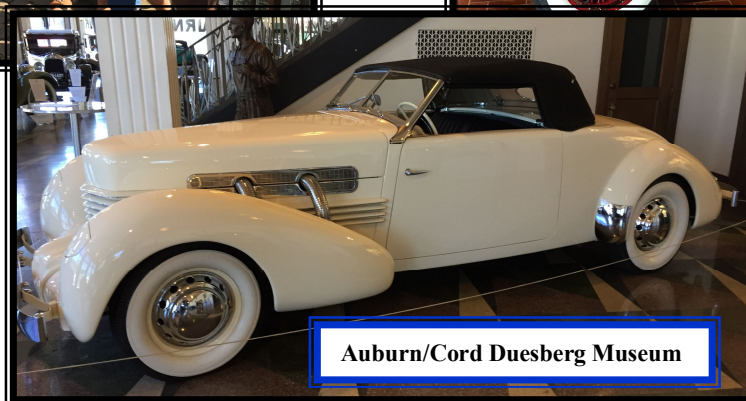
Auburn/Cord Duesenberg Museum